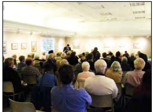
Listeners fill the Community Room at a recent I-House event on the Mideast.